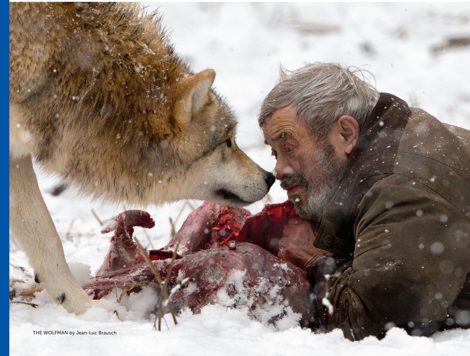
THE WOLFMAN by Jean-Luc Brausch

The International Federation of Photographic Art is active world-wide. Its purpose is the promotion of photographic art in all its aspects and through all kinds of photographic events. All considerations of political, ideological, racial or religious nature are totally excluded from FIAP activities.